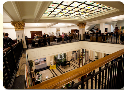
The Henry Clay

Nearly 40 handpicked artists will have their works for sale, giving guests a chance to shop for fine art in a relaxed, comfortable environment. Tickets will go on sale soon; visit CASARiverRegion.com or like us on Facebook for more information.